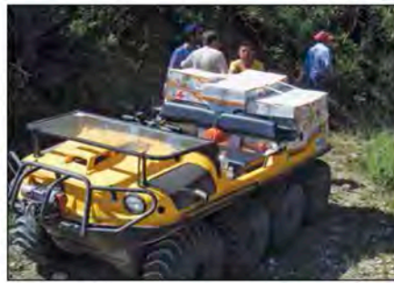
First Aid Support (Red Cross / Crescent)