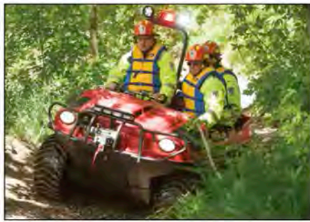
Search & Rescue