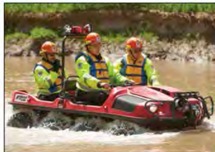
Amphibious Personnel Carrier