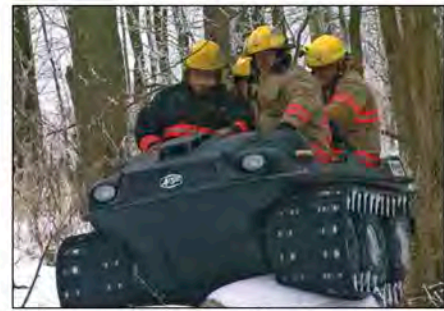
Operation in -40°C (-40°F)