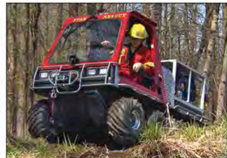
8x8 CENTAUR with Fire Pump