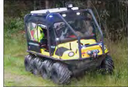
Optional Roll Over Protection Structure