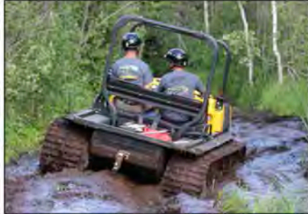
Deep Mud Performance